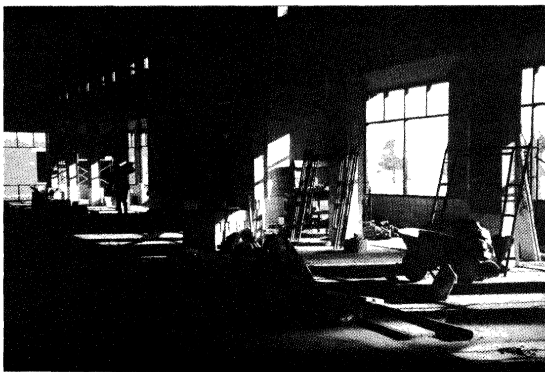
Shadows create artistic images in the new student center.

During this construction/deconstruction students and staff have been through and survived Phase I with interruptions of telephone, sewer, water, and electric services. Also included, have been expansion and renovation of footings, underground utilities, two transformers, a new south entrance, and the replacement of a chiller.