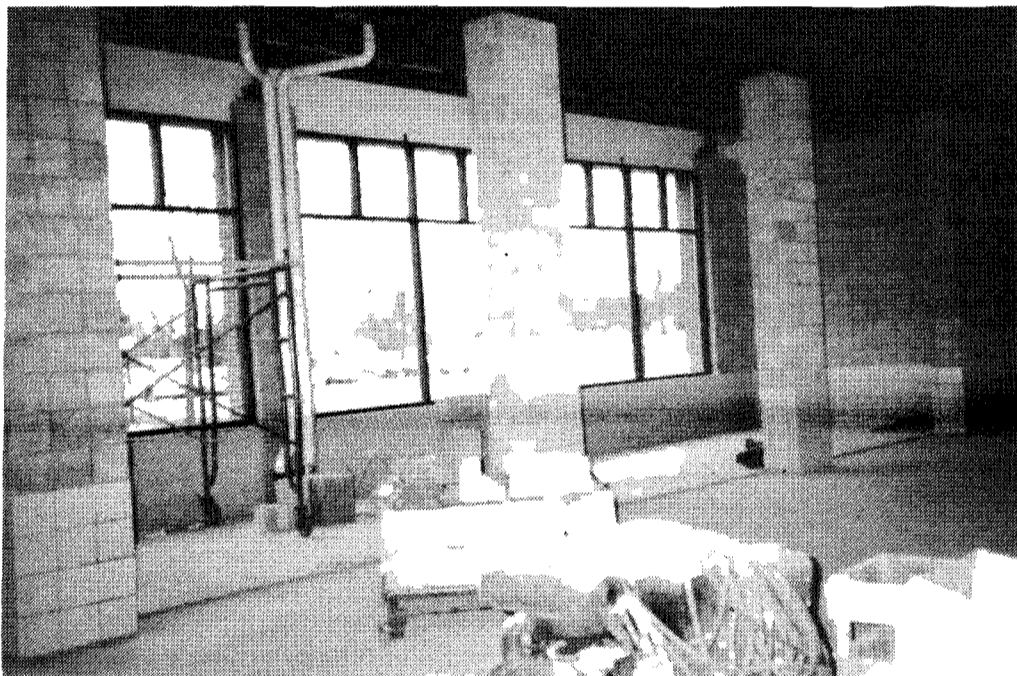
The new student center under construction provides new southern exposure. Construction for phase I started early May of 1994.