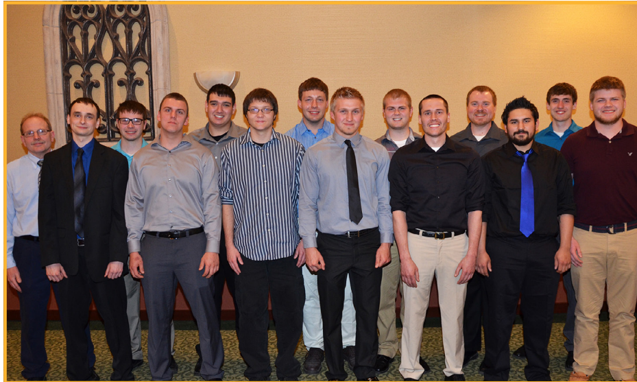
Graduates of Ford Automotive Student Service Educational Training program.