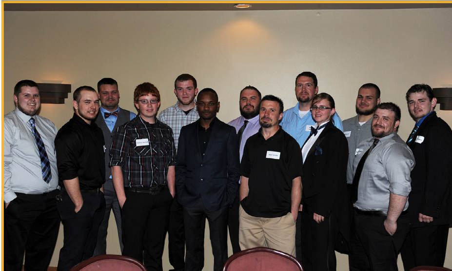
Graduates of DMACC's Automotive Service Education Program