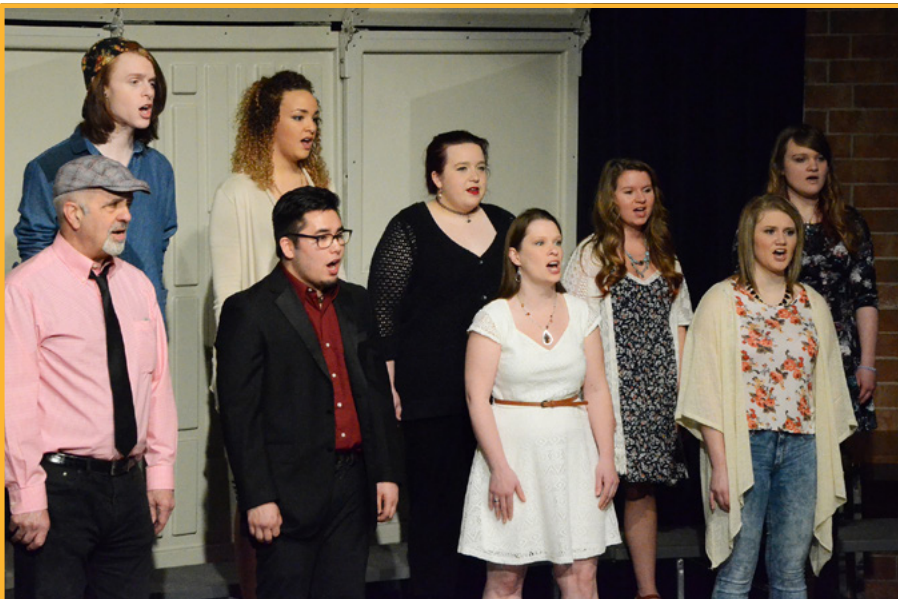
DMACC Chamber Ensemble