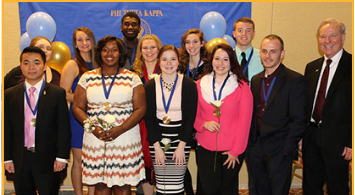
DMACC All-Iowa Academic Team