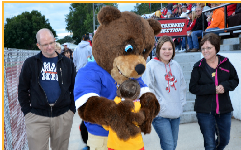
DMACC Night at the Newton Senior High School football game.