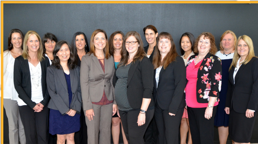
The Diversity in Application Development Class