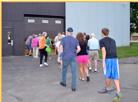
DMACC Garage Sale at Automotive Lab

Dozens of people wait for the 7 a.m. opening of the automotive lab garage doors signifying the start of the DMACC Pioneers Garage Sale.