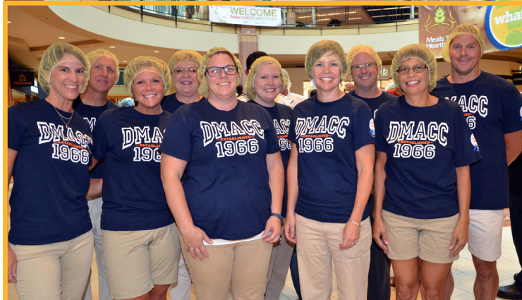
DMACC Team for Meals of the Heartland