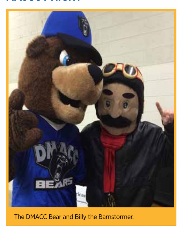
The DMACC Bear and Billy the Barnstormer get together for a picture during Mascot Night at an Iowa Barnstormers football game on Saturday, May 2.