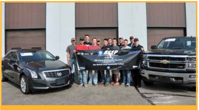
DMACC-GM Automotive Service Education Program.

General Motors has donated a 2014 Cadillac ATS and a 2014 Chevrolet Silverado to the DMACC GM Automotive Service Education Program (ASEP) so the students can learn the latest technology found on today's vehicles. Some of the students who work on these vehicle, which