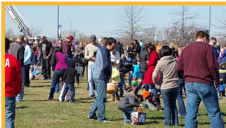
DMACC West Campus Easter Egg Hunt

Hundreds of kids search for Easter eggs on the DMACC West Campus front lawn in the annual Easter Egg hunt co-sponsored with the West Des Moines Firefighters Association.