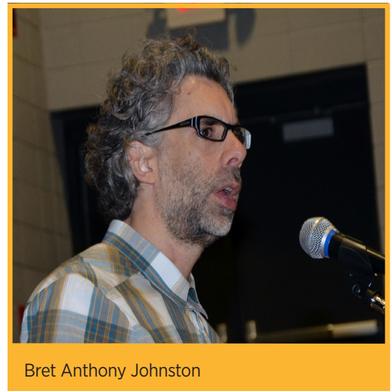
Bret Anthony Johnston