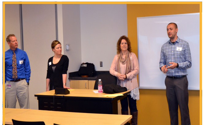
Panel discussion at the Discover Education Day