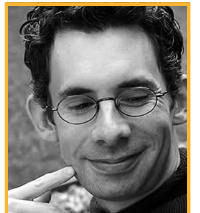
Bret Anthony Johnston