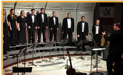
DMACC Ankeny Campus Chamber Ensemble