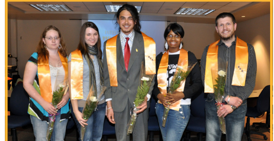
All-Iowa Academic Team