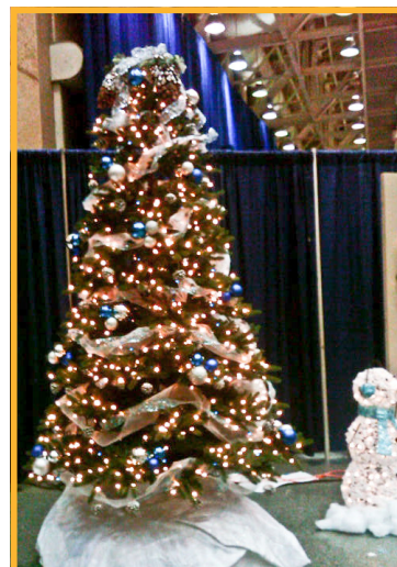
DMACC Festival of Trees and Lights Display