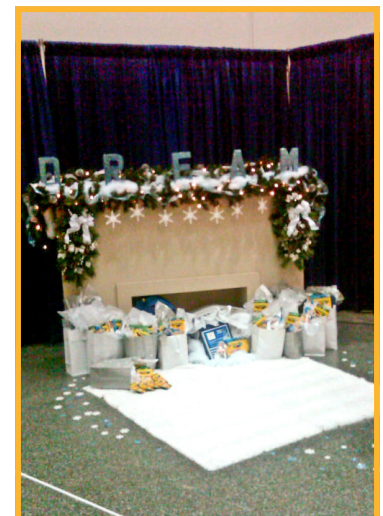
DMACC Festival of Trees and Lights Display