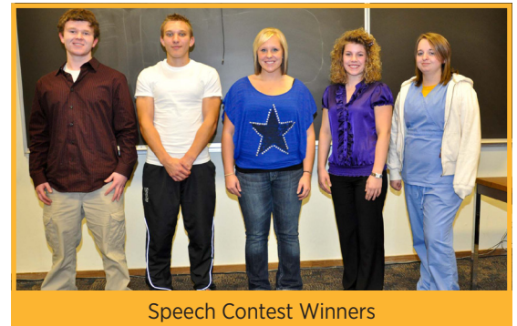
Speech Contest Winners