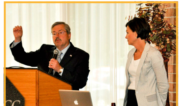
Terry Branstad (left) and Kim Reynolds

Iowa Governor Terry Branstad (left) and Lieutenant Governor Kim Reynolds speak at the Iowa Jump$tart Coalition's 11th Annual Conference on Personal Financial Literacy. The daylong conference, "Show Me the Money," was held in the DMACC Ankeny Campus Bldg. #7 Conference Center. The conference featured numerous speakers and workshops and was sponsored by the Iowa Insurance Division Investor Education Fund, Consumer Credit of Des Moines and the Iowa Credit Union Foundation.