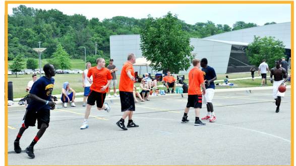
Action spread throughout