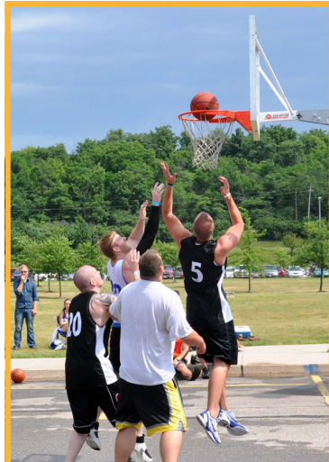
Congested in the lane

At times the action was congested in the lane and at other times spread throughout the court. The action was intense, but winners and losers congratulated each other at the end of each contest.