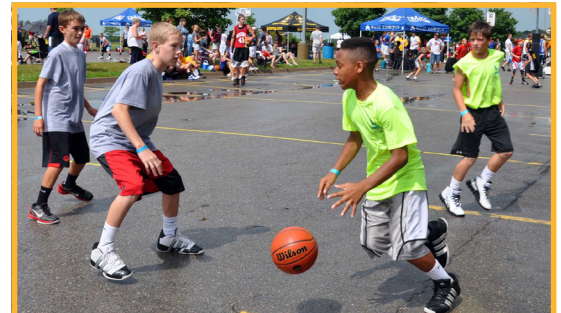
Dribbles towards hoop

With the courts still wet from a lingering shower and accompanying lightning that delayed the start of the competition a couple of hours, a young male dribbles toward the hoop. A total of 80 teams participated in the daylong event. The exact amount of money raised is still being determined.