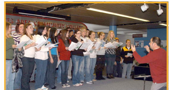
DMACC Concert Choir