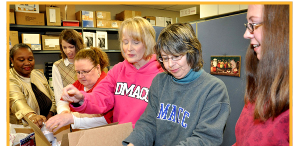
Ankeny Campus Finance Department members