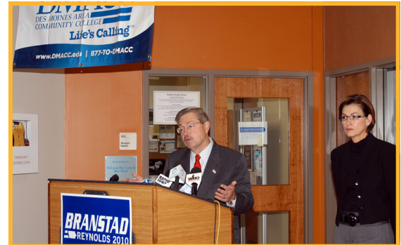
Terry Branstad and Kim Reynolds

Iowa gubernatorial candidate Terry Branstad (left) and Kim Reynolds, who is running for lieutenant governor, held a news conference in Bldg. #24 on the DMACC Ankeny Campus on Oct. 5. Branstad proposed exposing every Iowa student from the kindergarten level, through K-12, community college and regents institutions, to an entrepreneurship mindset. He also proposed a 50 percent tuition tax credit for businesses that pay the college tuition for future workers. Branstad is running for governor against incumbent governor Chet Culver.