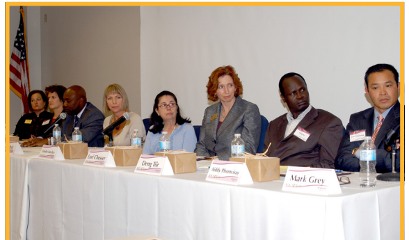
Immigration discussion panelists