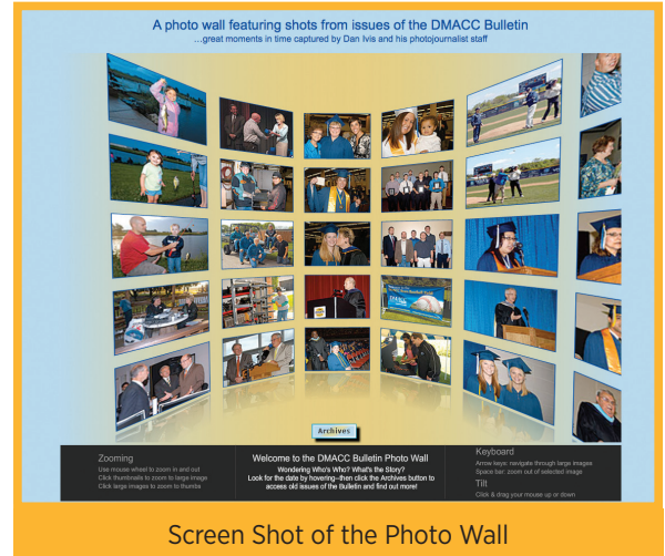
Screen Shot of the Photo Wall

A new feature making its debut in today's DMACC Bulletin is the "Photo Wall." In this photo wall, is a collection of photos that have appeared in previous issues of the DMACC Bulletin, as well as photos appearing in the current issue. To view the photo wall, please click in the area under "photo wall" located in the left column of the Bulletin following the Archives area. To get a closer view of any of the photos, please click on the photo and it will zoom in as a single color photo on your screen. Directions for zooming, keyboarding and tilting are located at the bottom of your computer screen when viewing the photo wall. When you hover over a particular photo, the date that photo appeared in the Bulletin will be displayed. You can then, click on the Archives button to access old issues of the Bulletin and find out more about the photo. Special thanks to Jeff Wheeler for designing the photo wall in the Bulletin.