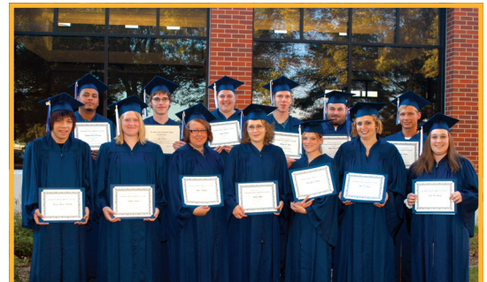
Boone GED Graduates